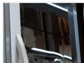
Inner LED light