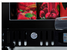
Lock fitted as standard