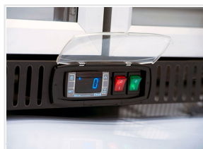
Main switch, light switch and digital thermostat fitted as standard