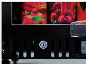
Lock fitted as standard