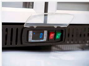
Main switch, light switch and digital thermostat fitted as standard