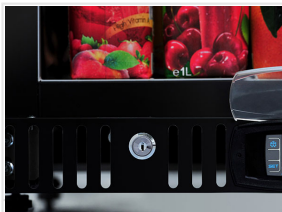
Lock fitted as standard