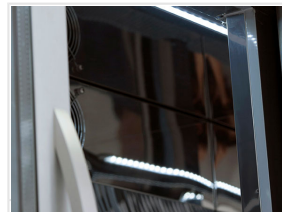
Inner LED light