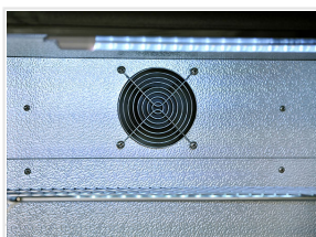
Inner assistance fan