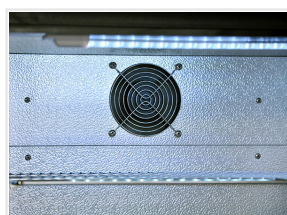
Inner assistance fan