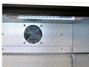
Inner LED light