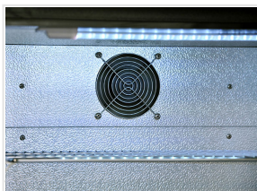
Inner assistance fan