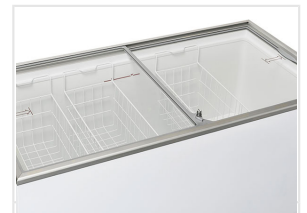
Top view of the unit