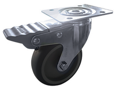
Castor included in the packaging (To be assembled)