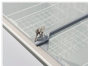
Lock fitted as standard