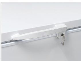
Handle with lock