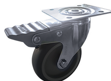
Castor included in the packaging (To be assembled)