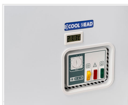
Digital control panel with alarm