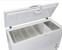
Top view of the unit