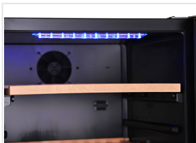
Led LED light (BLUE Color)