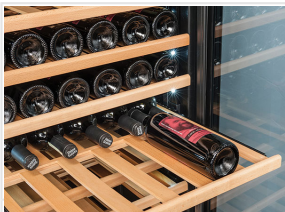
Adjustable wooden shelves