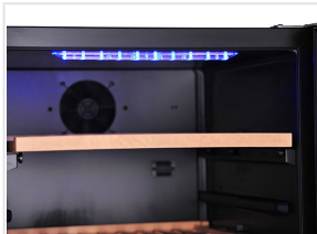
Led LED light (BLUE Color)