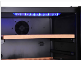
Led LED light (BLUE Color)