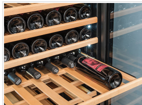
Adjustable wooden shelves