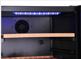
Led LED light (BLUE Color)