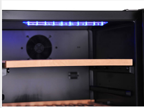
Led LED light (BLUE Color)