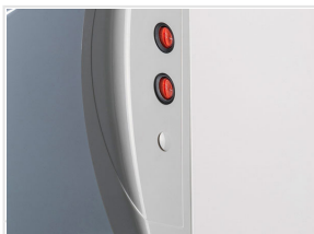
Independent light switches for inner light and canopy