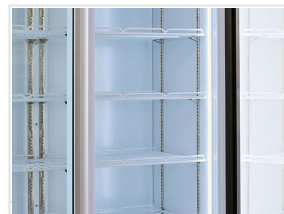
Inner LED light