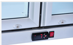
Digital thermostat and independent light switch