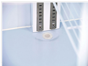
Bottom hole for easily clean and dry the item