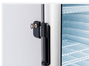
Handle with lock along door profile