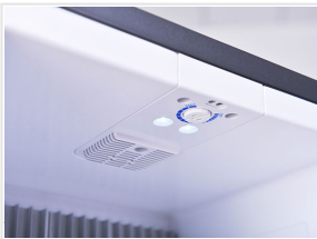
Inner LED light