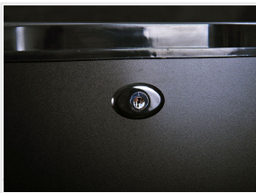
Lock fitted as standard