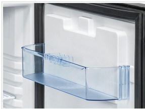
Inner door rack