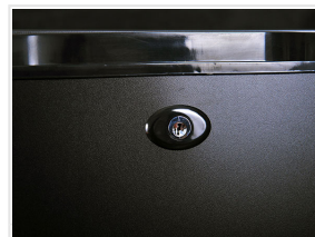
Lock fitted as standard