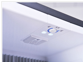
Inner LED light