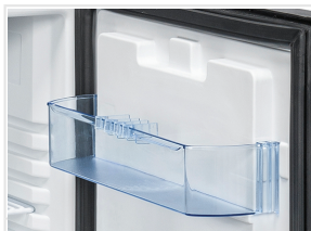
Inner door rack