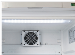
Inner assistance fan