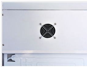
Inner assistance fan