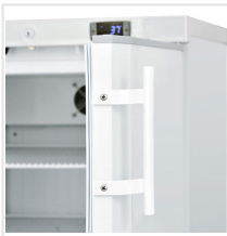
External cylindric handle in stainless steel (Steel color for X Version)