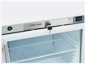
Main switch, digital thermostat and door lock fitted as standard