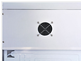
Inner assistance fan