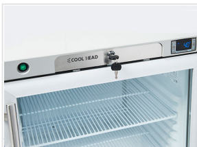
Main switch, digital thermostat and door lock fitted as standard