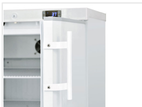
External cylindric handle in stainless steel (Steel color for X Version)