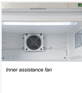
Inner assistance fan