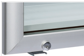
Lock fitted as standard