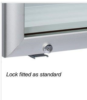
Lock fitted as standard