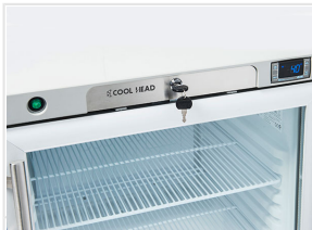
Main switch, digital thermostat and door lock fitted as standard