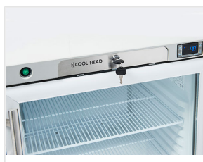
Main switch, digital thermostat and door lock fitted as standard