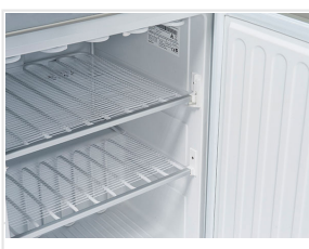
Fixed evaporator shelves