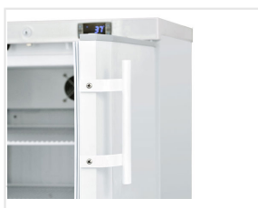
External cylindric handle in stainless steel (Steel color for X Version)