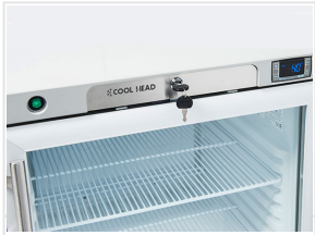
Main switch, digital thermostat and door lock fitted as standard