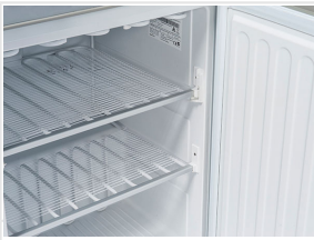
Fixed evaporator shelves