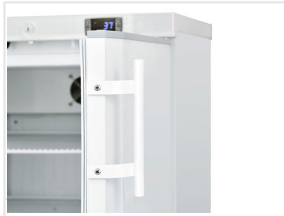
External cylindric handle in stainless steel (Steel color for X Version)