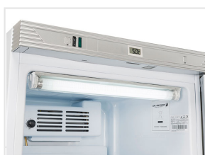
Fluorescent light with digital thermometer on upper panel