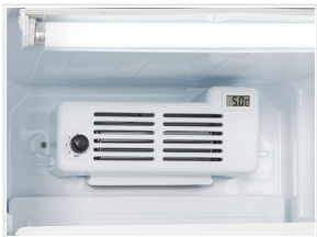
Fluorescent light with inner digital thermometer (Model with canopy)