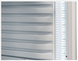
Inner vertical LED light