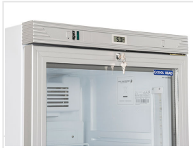
Digital thermometer, lock and independent light switch fitted as standard