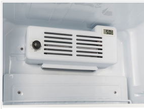
Inner digital thermometer (Model with canopy)