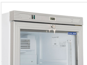
Digital thermometer, lock and independent light switch fitted as standard