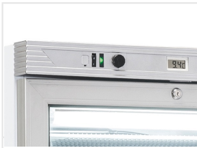
Digital thermometer on the upper front panel