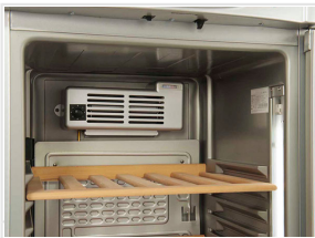
Inner assistance fan