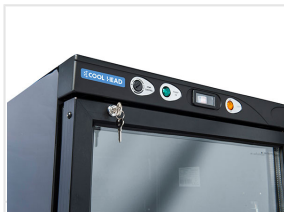
Front panel with main switch, thermostat knob and key fitted as standard